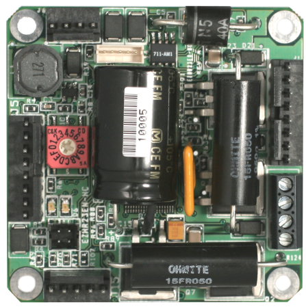
Model EZHR23ENHC actual size